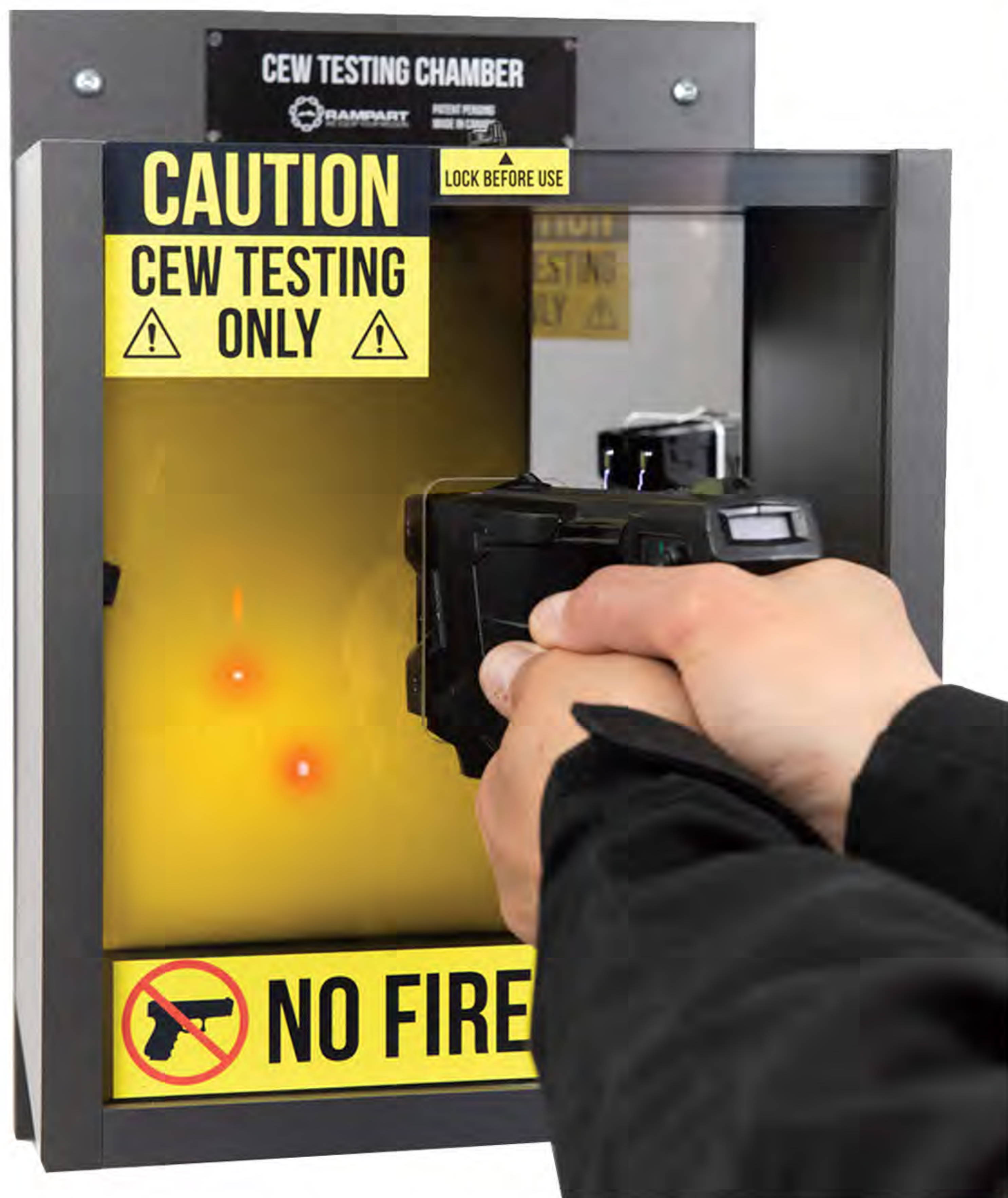
RAMPART GEN 2 CEW TESTING CHAMBER

THE CHAMBER IS INDEPENDENTLY CERTIFIED FOR: